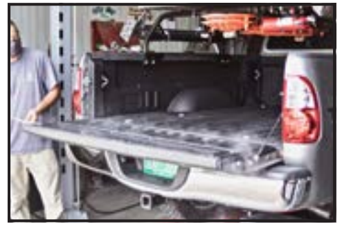
And the tailgate cavities as well.