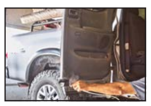
Now we get the door cavities protected.