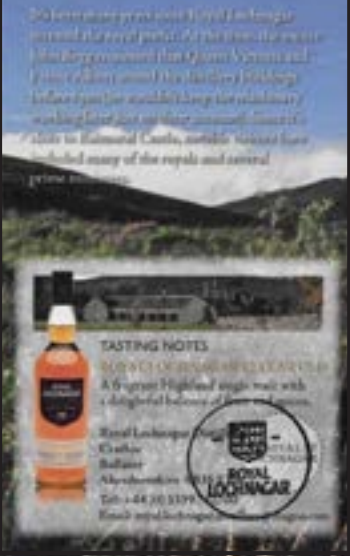
(Continued on page I7)