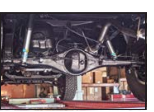
Here's the Hardwax after drying.