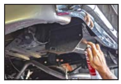
Here a spray can directly covers surfaces behind the area bumper.