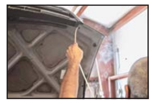
And now we protect cavities in the hood, er, bonnet.