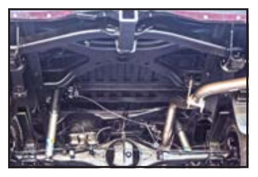
Pickup bed after the Waxoyl applications.