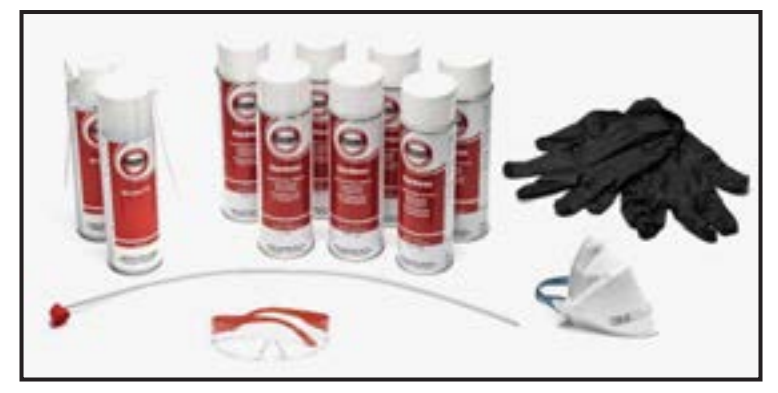
This is a medium-sized Waxoyl DIY kit.